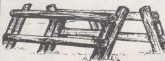
6. OXER MASSIF