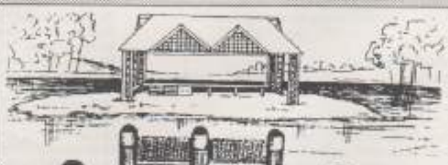
25 ABC. LAND ROVER LAKE