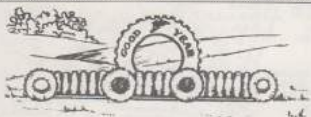
1. GOOD YEAR ARCH