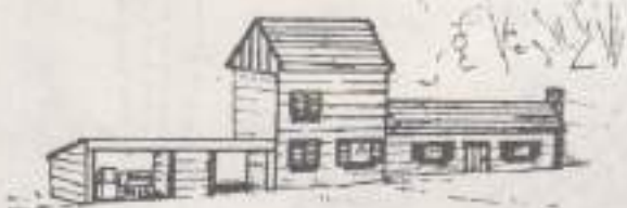
3. EQUINADE MANOR