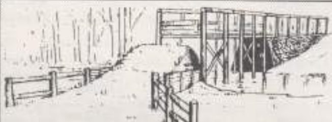
10. BROKEN BRIDGE