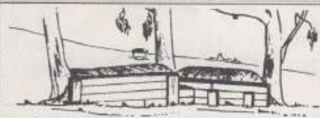
28 GARDEN MOUND