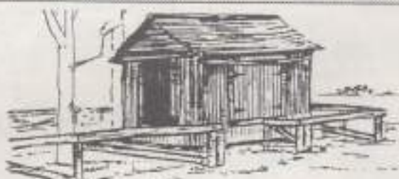
4AB. FARNAM STOCKMAN'S HUT