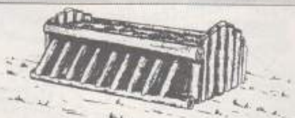
2. STREETS HAY FEEDER